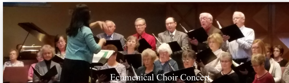
Ecumenical Choir Concert