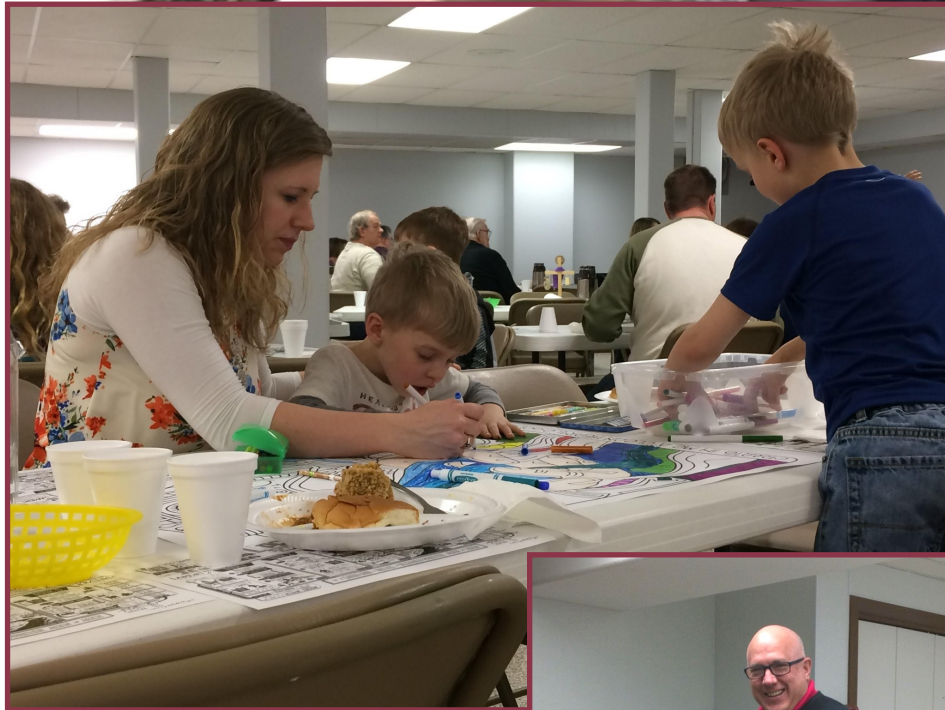
Lent Open Table