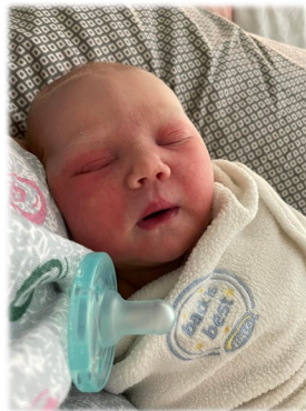
Born May 31, 2022 Baptized June